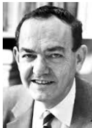
Herbert Simon (1916–2001)