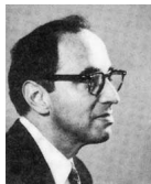
Thomas Kuhn (1922–1996)