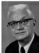
Carl G. Hempel (1905–1997)