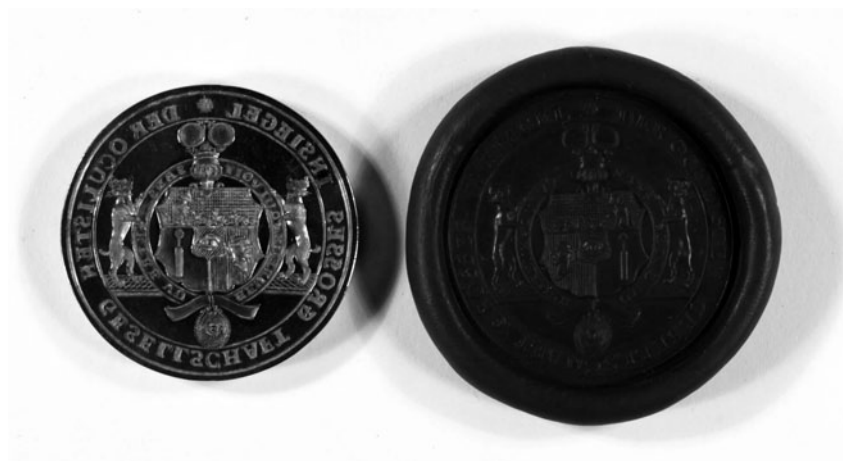
Figure 3. Picture of the Seal of the Oculist Society, NLA-Staatsarchiv Wolfenbüttel, signatures VI Hs 15 Nr. 143 and 10 Slg 6–13, STAWO 10 Slg 8 and 9.

A scalpel/needle used for cataract surgery, a pair of epilation tweezers, an anatomic model of an eye that can be taken apart, and the matrix of the seal of the Society complete the collection. 12