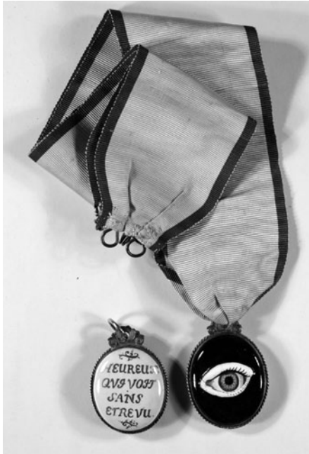
Figure 2. Eye-medallion, NLA-Staatsarchiv Wolfenbüttel, signatures VI Hs 15 Nr. 143 and 10 Slg 6–13, STAWO 10 Slg 8 and 9.

on the order of the Grand Lodge in Berlin, but there is no proof for the existence of any Oculist lodge besides the one in Wolfenbüttel.