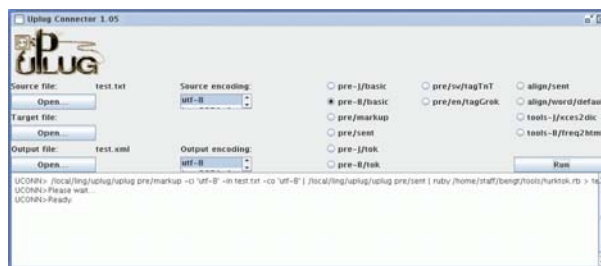
Figure 2. The Uplug Connector

The Uplug package consists of a number of perl scripts accessible by line commands with a large number of options and sometimes utilizing piping between commands. To facilitate easier access and usage of these scripts, a graphical user interface, UplugConnector, was developed in Java for the project. Here, the user can in a simple fashion choose a specific task to be performed and let the graphical user interface (GUI) set up the proper sequence of calls to Uplug and subsequently execute them. The figure below illustrates the Uplug Connector interface.